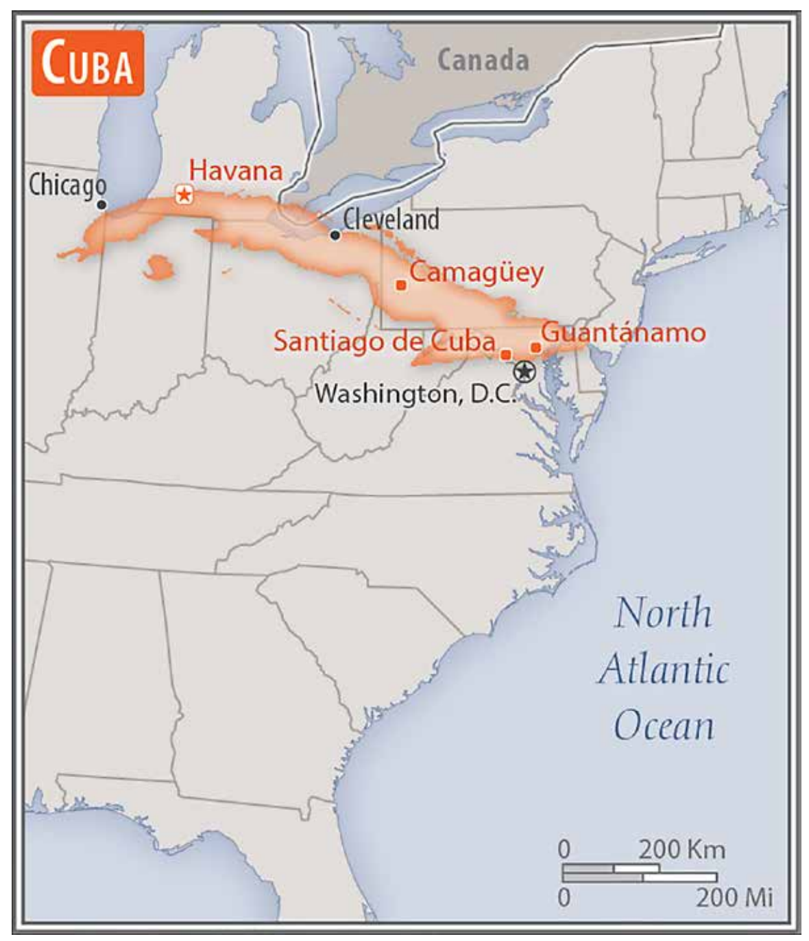
Source: Central Intelligence Agency, The World Factbook, available at <www.cia.gov>.