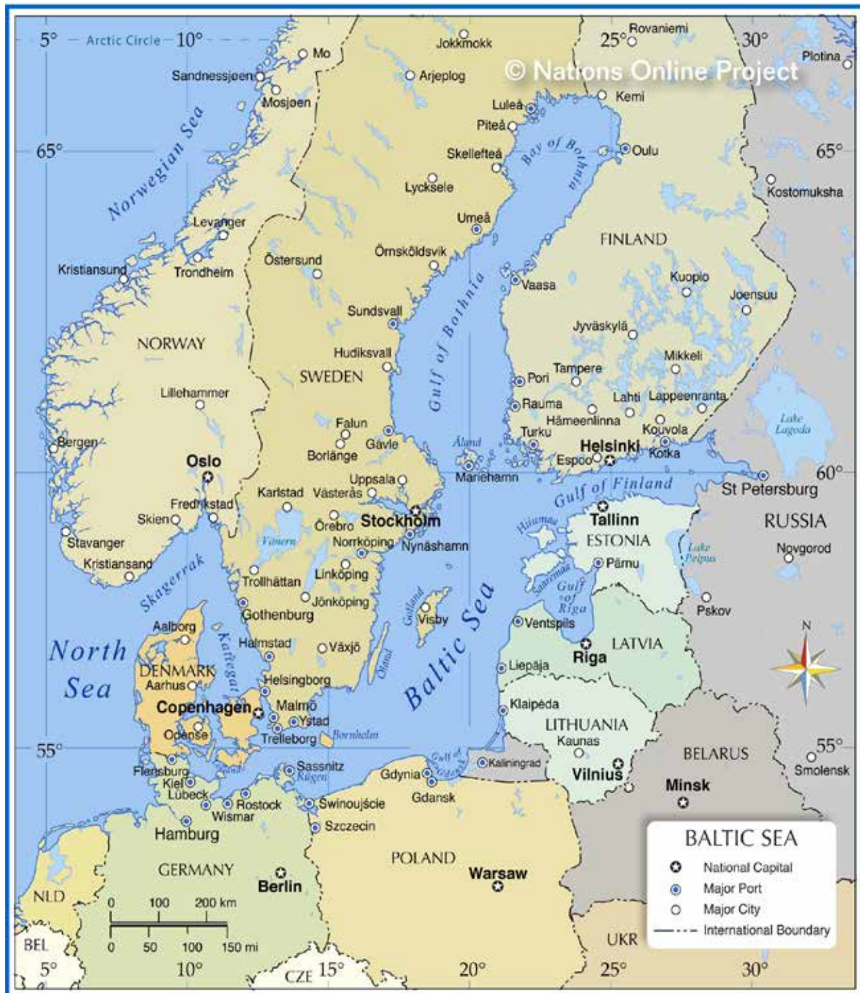
Figure 1. Baltic Sea Region

a militarily inferior country could achieve victory over a militarily superior adversary. This principle especially holds when strategic aims are limited. In this scenario, a militarily inferior country could hope to achieve a situation where the costs to its adversary of reversing its initial